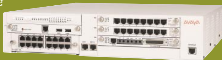
Avaya™ S8300 Media Server with an Avaya™ G700 Media Gateway