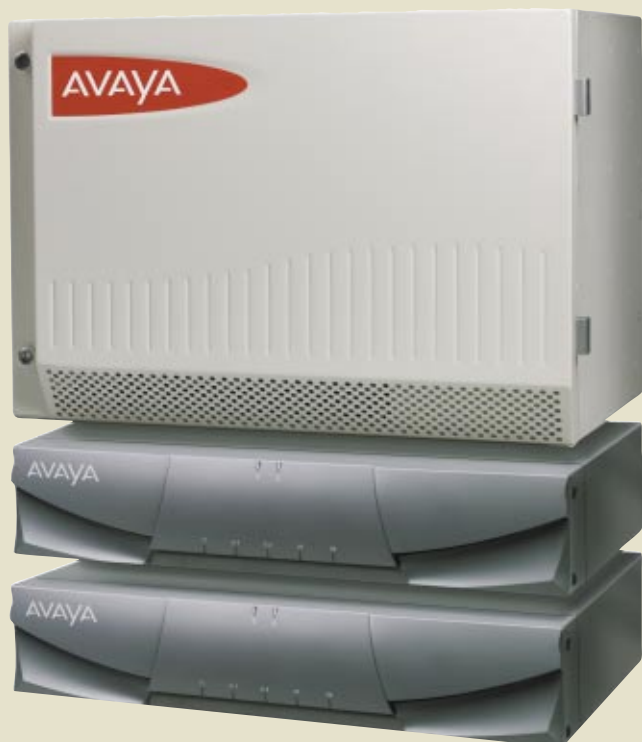
Avaya™ S8700 Media Server with an Avaya™ G600 Media Gateway

Designed to meet the goals of today's enterprises and government organizations—growing revenue, reducing costs, and utilizing resources more efficiently—Avaya Enterprise Class IP Solutions (ECLIPS) and Avaya MultiVantage Software offer a welcome alternative to a total reinvention of voice and data networks. Now enterprises don't have to reinvent; they can rethink by leveraging current investments in Avaya or others while migrating toward a fully converged network. Or, they can build a fully converged network from the ground up with the peace of mind that the investments they make today won't have to be reinvented tomorrow.